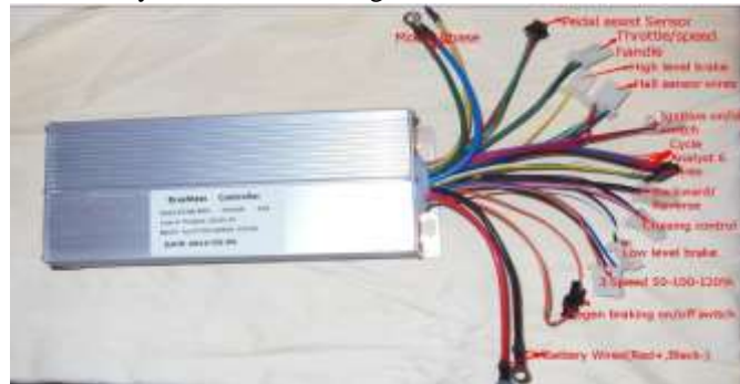
Motor controller used for this study

The controller is used to control the motor voltage and change voltage rating with the time to provide the motor. Motor controller changes voltage DC to AC. The controller is a multi-functional device and the brain of our vehicles. It provides signal to all major electronics components like accelerator, display panel, brakes, etc. It activates when it receives voltage from the battery and supplies power from that battery to the motor on receiving the accelerator signal. Low voltage cutoff monitor the battery voltage and shut down the motor if the battery voltage is too low that time protects the battery from over discharge.