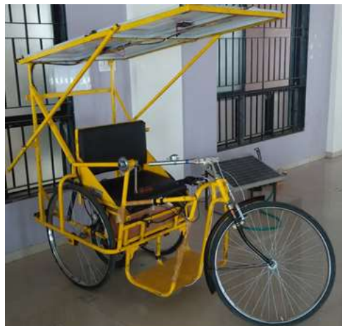
Fig. Working model of solar tricycle

A 4 cm x 15.7 cm solar cell's electricity output is likely rated at 0.52 to 0.63 volts with 3 amps. Here, in the module, 36 cells are connected (in series) together so that in all operating conditions a PV module gives well above 12 volts, which is the required to charge a 12 V battery. We have totally used four solar panels to generate adequate power to run solar tricycle. [1]