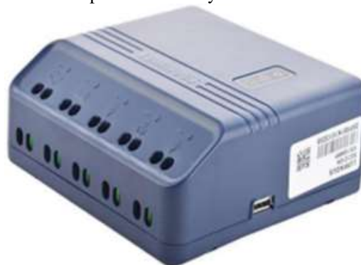
Solar charge controller used for this study

It provides stable ratio of the current from the solar panel to the battery. Because of change in solar radiation, change output is vary time to time of the solar panel. We provided two solar charge controller in series connection and because of that continues flow of the current passed to battery.