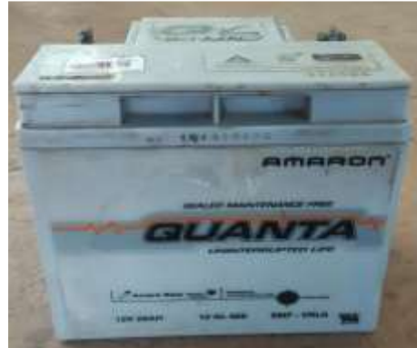
Battery used for this study