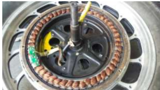
BLDC hub motor used for this study

The hub motor is a conventional DC motor. The rotor is outside the stator with the permanent magnets mounted on inside. The stator is mounted and fixed onto the axle and the hub will be made to rotate by alternating currents supplied through batteries. Hub motor generates high torque at low speed, which is highly efficient and which doesn't need sprockets, brackets and drive chains. This means they are very reliable and have a long life. The main characteristic of Brushless DC Machines is that they may be controlled to give wide constant power speed ranges. [5]