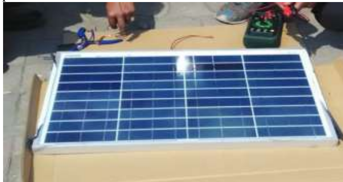
Solar panel used for this study

The photoelectric and photovoltaic effects are related to sunlight, but are different in that electrons are ejected from a material's surface upon exposure to radiation of sufficient energy in photoelectric, and generated electrons are transferred to different bands of valence to conduction within the material, resulting in the build-up of voltage between two electrodes in photovoltaic.